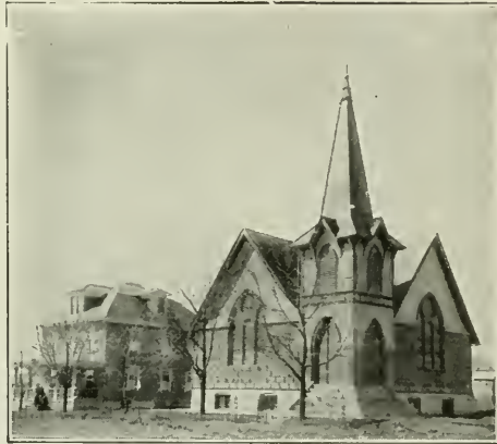
MAGYAR ALPHA, N. J. (Church and Manse)